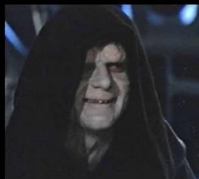
What the Media thinks I am