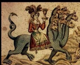
What Baptists think I am