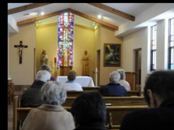
What I actually am