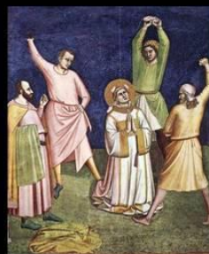
What I think I am