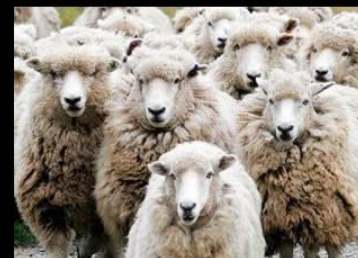
What Atheists thinks I am