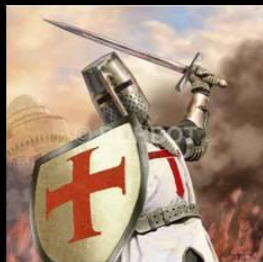
What Muslims think I am